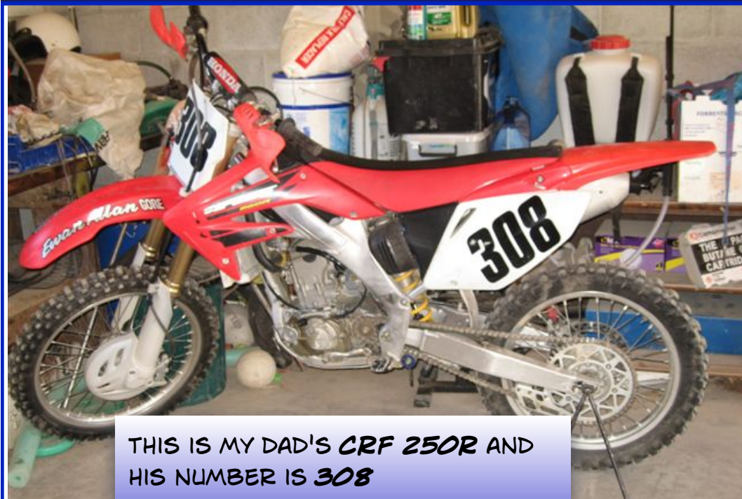
THIS IS MY DAD'S CRF 250R AND HIS NUMBER IS 308